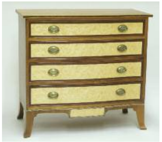
Exhibit photo (below, left to right)