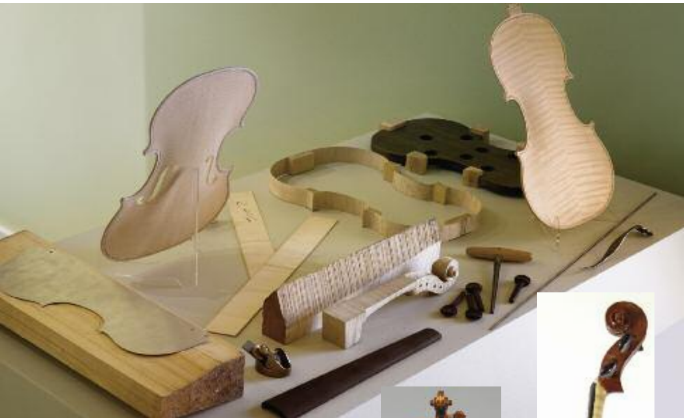
Exhibit photo (above)

So critical is the match between material and function that different woods are chosen for different parts. Even the history of the wood matters. The weather where the tree grew, the way the tree was cut, how the wood was cured all contribute to the complicated sound the instrument produces.