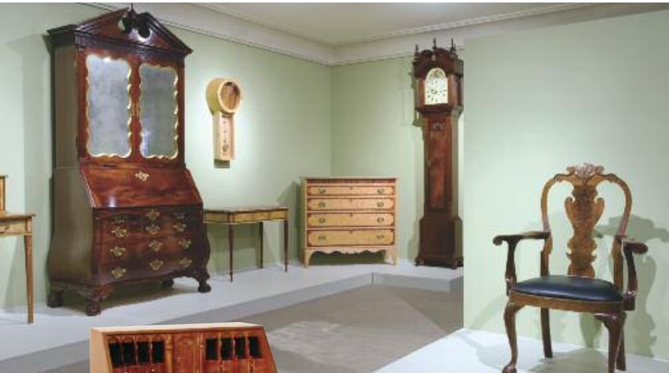
Exhibit photo (above, left to right)