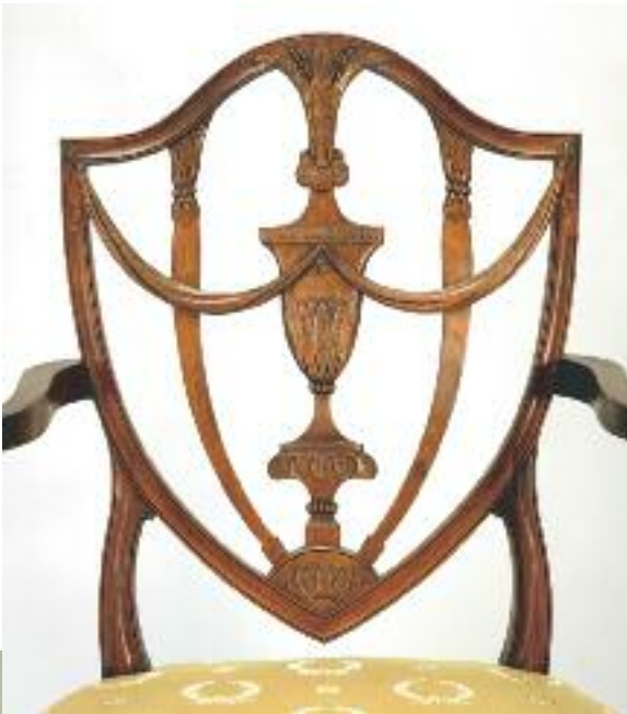
Exhibit photo (below, left to right)