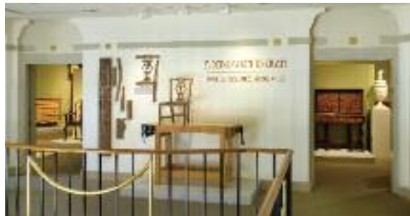
Exhibition entrance at the Concord Museum

First, it is a new collaboration with an important cultural institution in Greater Boston which shares a history and mission with North Bennet Street School. Both institutions were established in the mid 1880s by founders who were interested in education and cultural history, and both share a focus on the decorative arts and traditional craftsmanship. This jointly sponsored exhibition is the latest in a series of new collaborations with like-minded cultural institutions, including joint programs with the Massachusetts College of Art and Design (1873), the New England Conservatory of Music (1867), Boston Architectural College (1889), and perhaps most visibly, the preservation trades training program launched this year in association with the Shaker Museum and Library to assist with the restoration of the North Family at Mt. Lebanon Shaker Village, New Lebanon, NY.