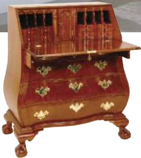
Clockwise from left to right