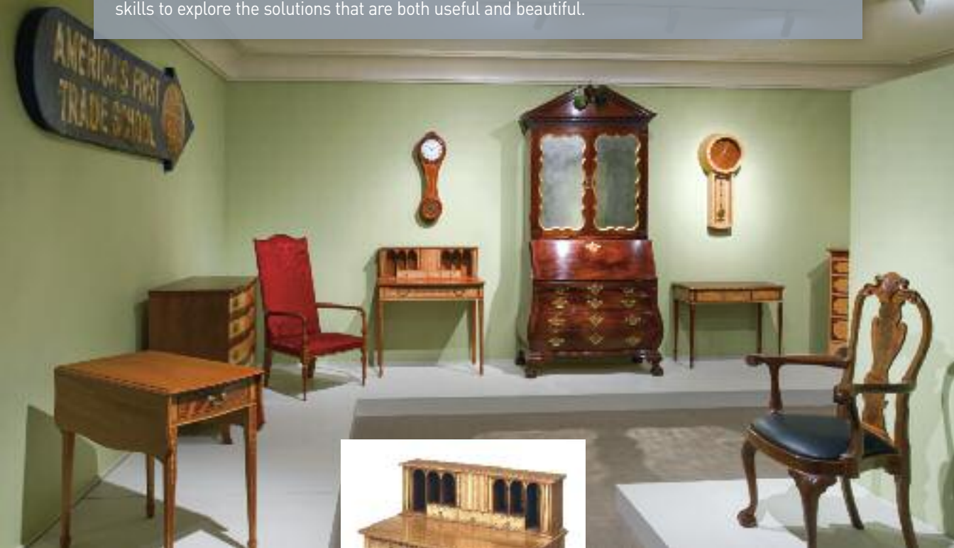
Exhibit photo (above, left to right)

The expert furniture maker uses a refined set of carving, joining, veneering, inlaying and finishing skills to explore the solutions that are both useful and beautiful.